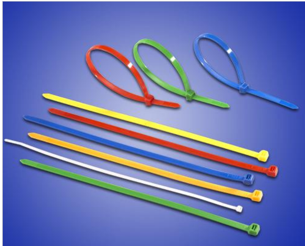
Product Name: SELE-LOCKING NYLON CABLE TIES